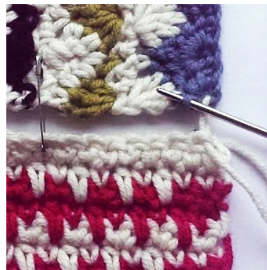
Insert needle into stem of next stitch from second swatch, making sure the position matches up.