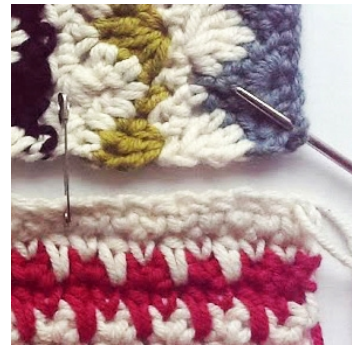
Next bring the needle over to the next square and insert into matching corner.