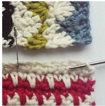
Thread sewing up needle with yarn and insert into the top of first corner.