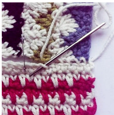
Zig zag between the squares until just before the centre, pull yarn tight to close the seam.