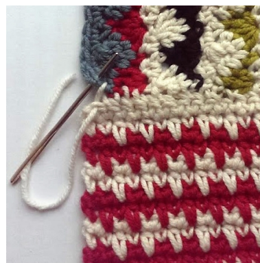
Continue sewing, remembering to pull the yarn tight every few 2 - 3cm to close the seam.