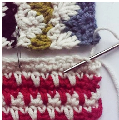
Insert needle into next stitch from first square.