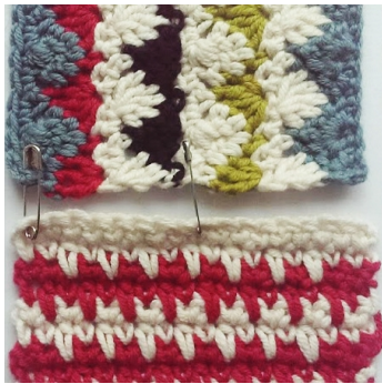
Place safety pins at the centre and end of the squares.